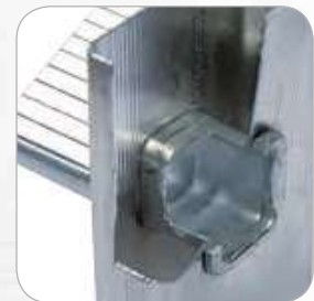
Stile/tread connection through triple expansion and crimping