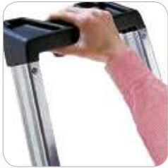
Large tool tray