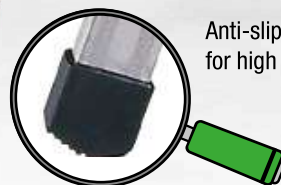
Anti-slip high shoes for high safety