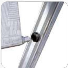
Nylon brasses, for the platform rotation