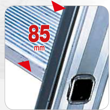
85 mm non-slip treads