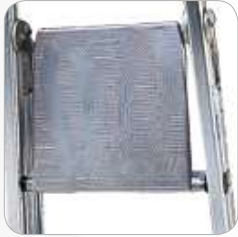
Aluminium die casting platform