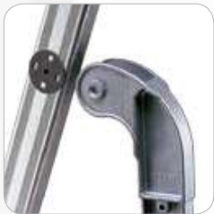
Aluminium die casting hinge with polyamide clutch insert to avoid the material wear and tear